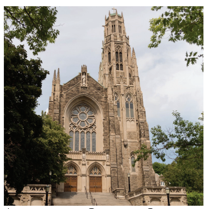
ANNIVERSARY OF CATHEDRAL OPENING

Congratulations to newly engaged couples. Reservations are now being accepted for weddings in 2023. The Cathedral requires one year's notice of marriage for Catholics who live within the Diocese of Hamilton.